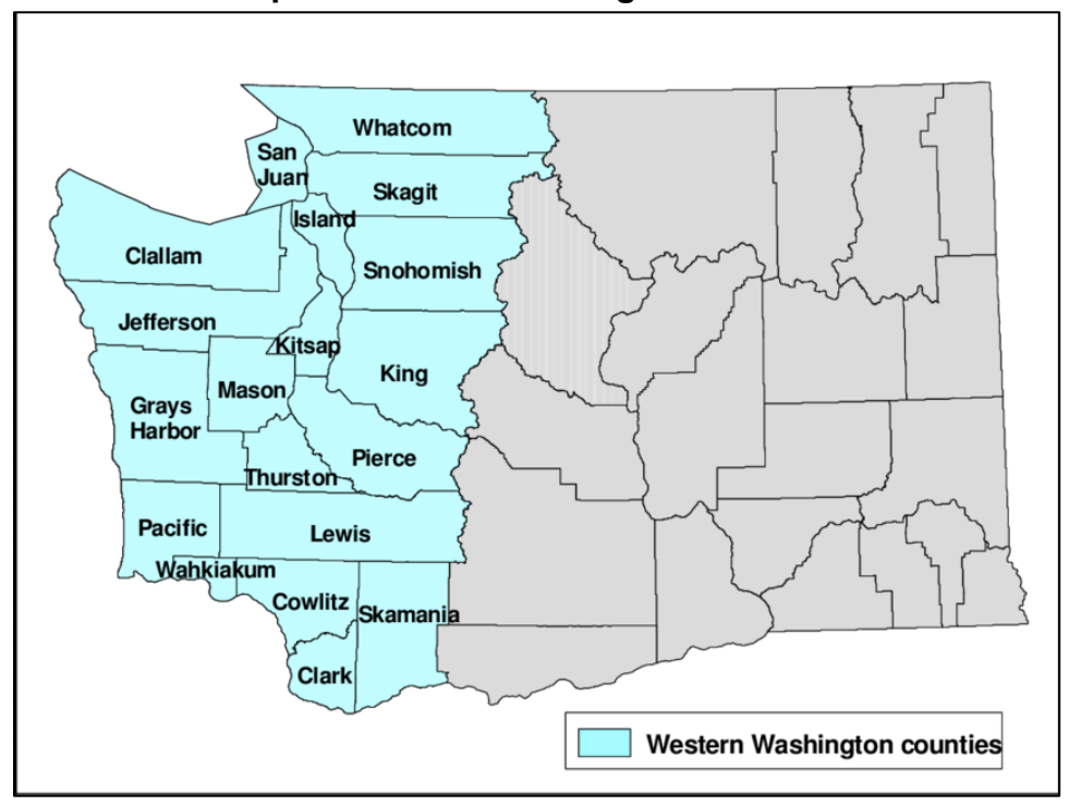
Map of Western Washington Counties