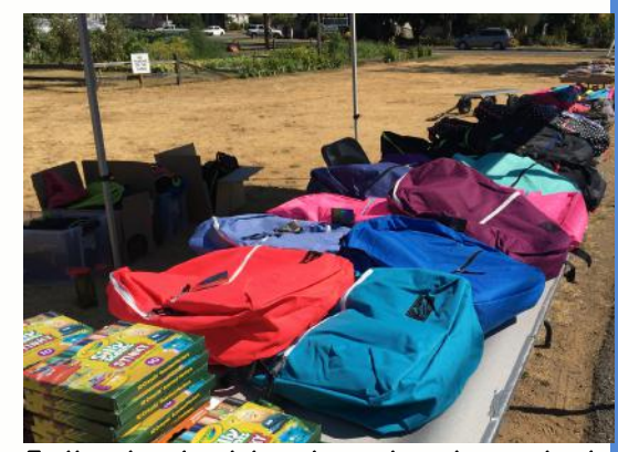
Fully stocked backpacks at our last food bank