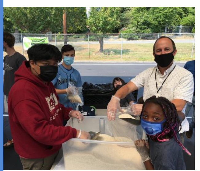
Agape On the Road participants sort rice for the Agape Food Bank