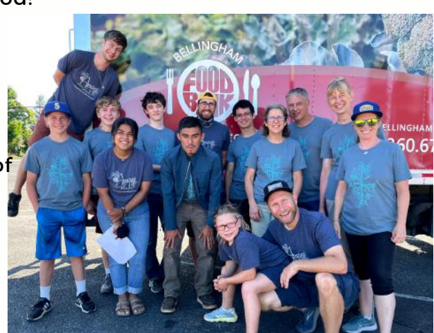
Agape staff and families from St. Patrick's at the food bank after serving 120 families!